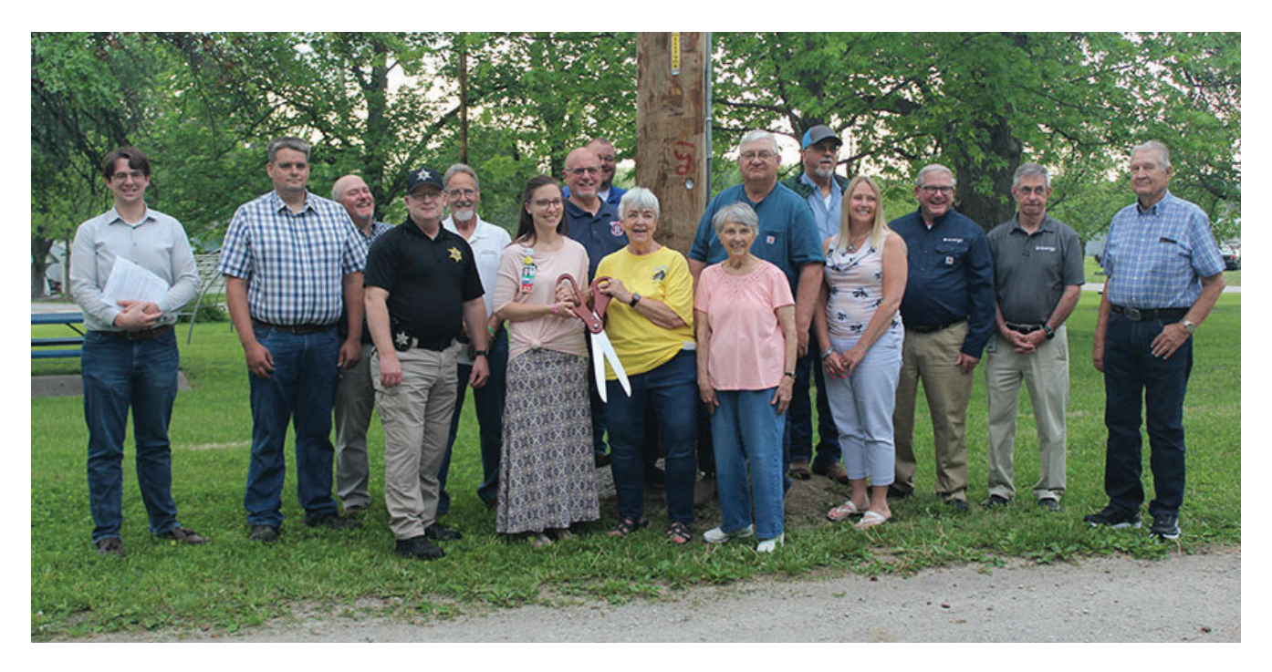
Andrew County SEMA Siren Ribbon Cutting Ceremony

Mo-Kan Regional Council is available to assist communities/counties in pursuing mitigation funds and updating hazard mitigation plans.