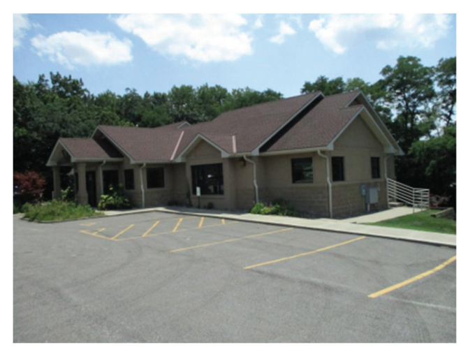
Activate Your Health