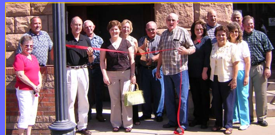
A ribbon cutting was held on May 25th for the new elevator in the Andrew County Courthouse.